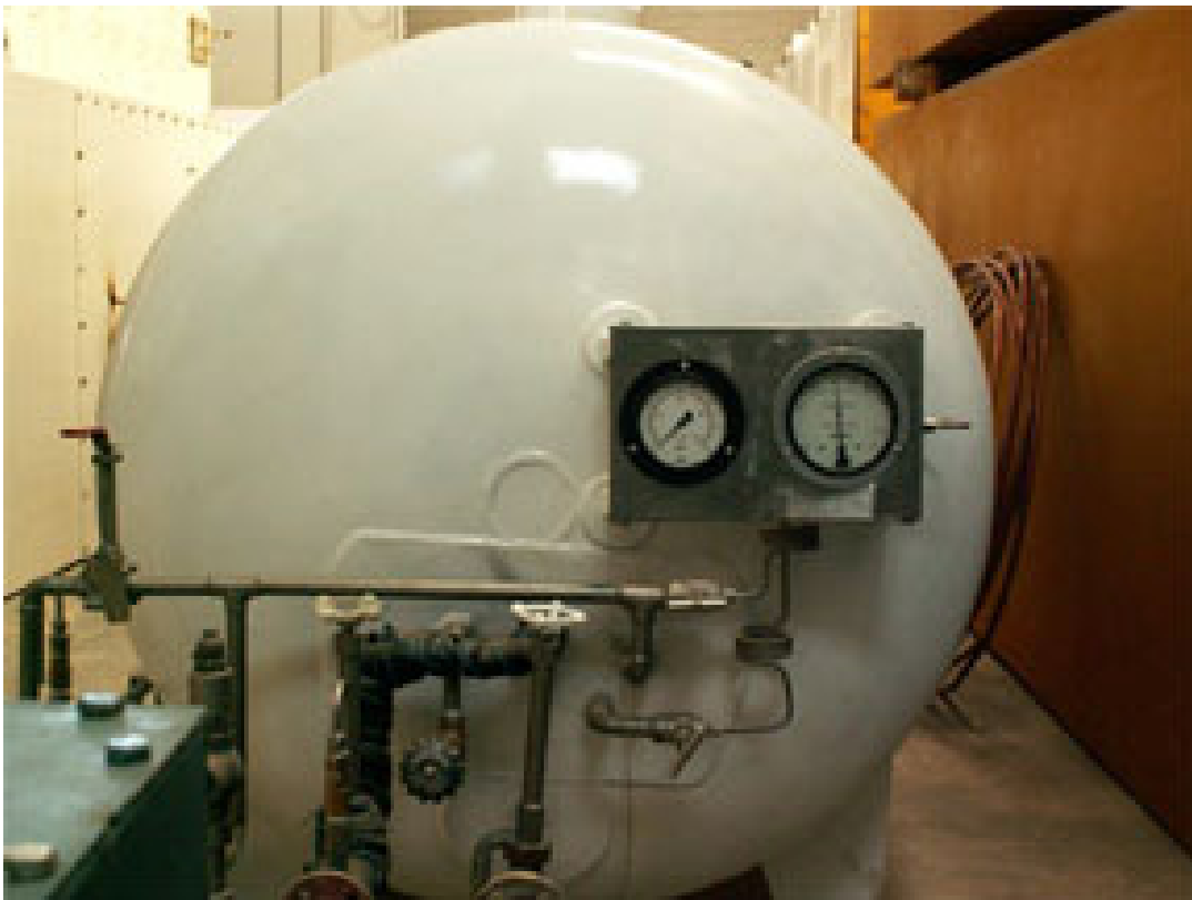
LIQUID NITROGEN STORAGE TANK