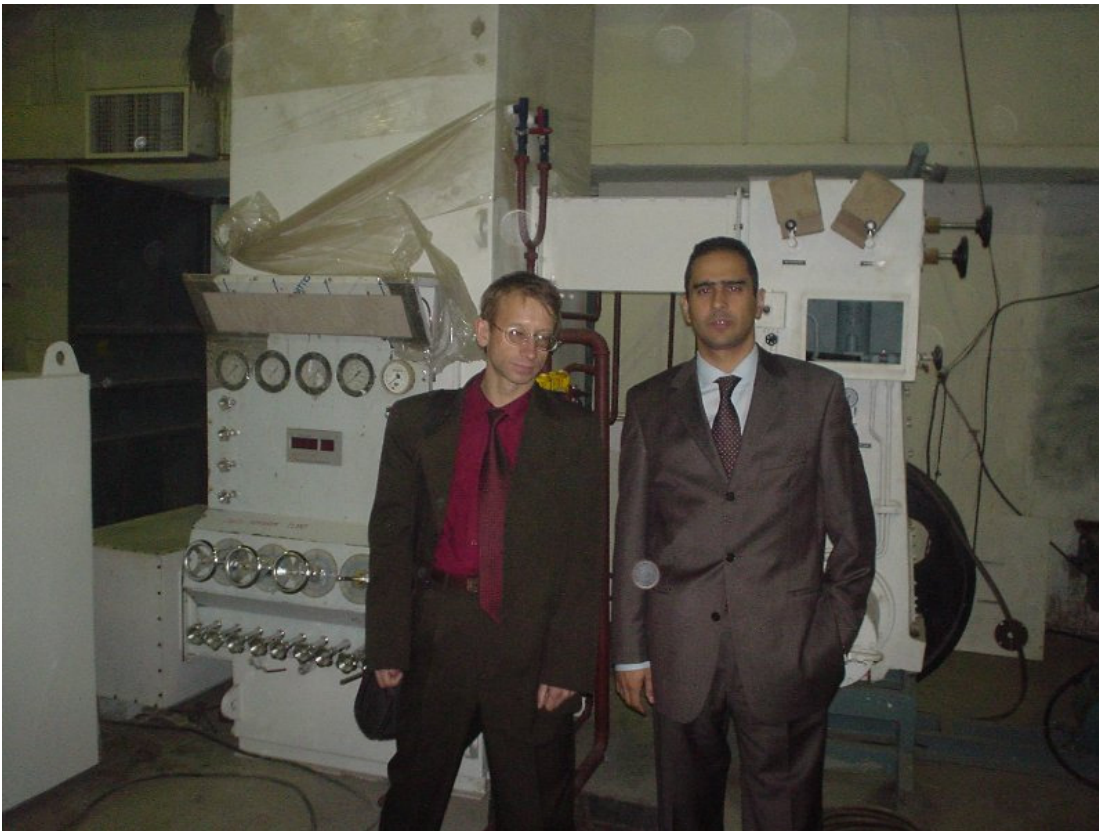
LIQUID GENERATOR OF CAPACITY 30 LITERS PER HOUR APPROVED FOR SHIPMENT