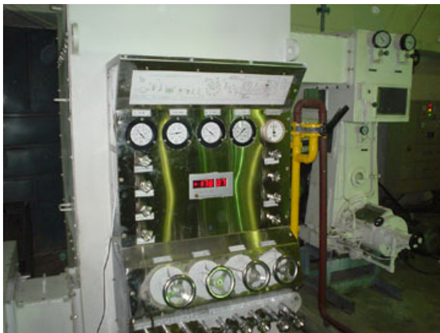
HIGH PURITY LIQUID NITROGEN GENERATOR UBLN50 FOR PEPSICOLA USAPURITY(>99.999%)