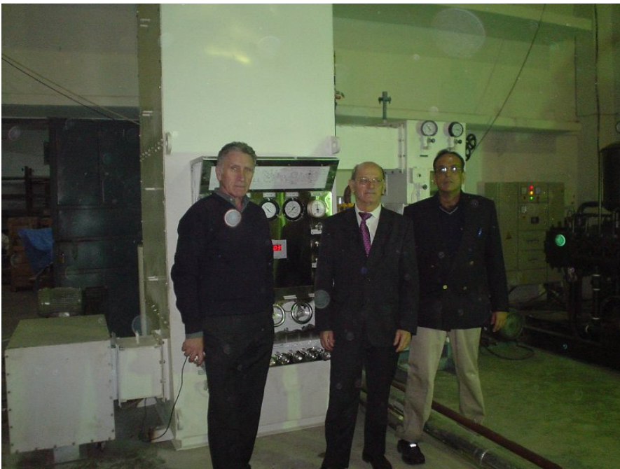
APPROVAL AS SUPPLIER FROM ENGINEERS OF AIR LIQUIDE FRANCE