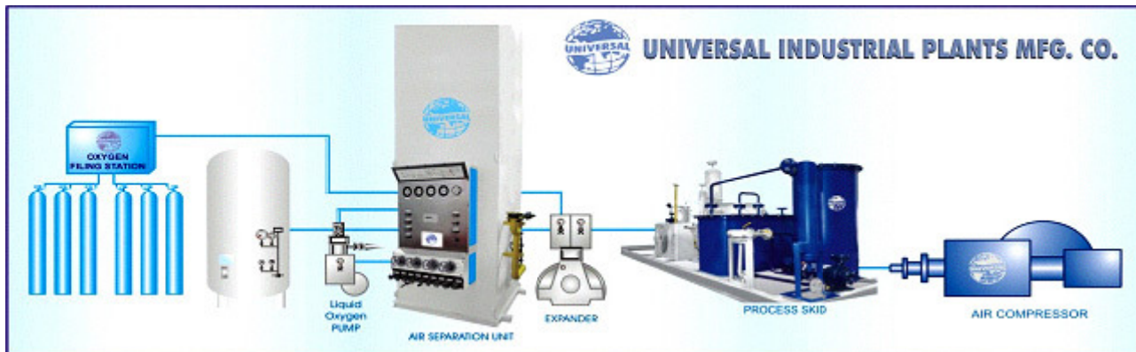
FLOW SCHEMATIC DIAGRAM