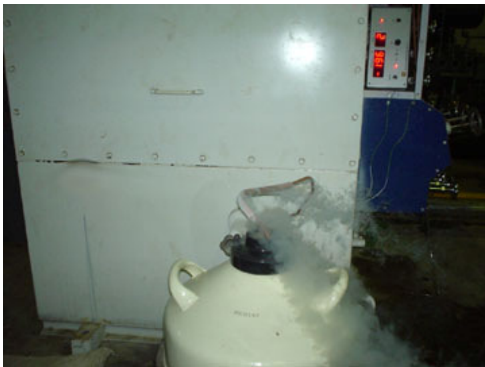
LIQUID NITROGEN GENERATORS ( FILLING IN LIN DEWARs)